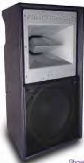
Shown with optional PX1 crossover module fitted

The Resolution 1 is a radical 2-way loudspeaker enclosure resulting from Tony Andrews' 30 years pioneering research and development of high efficiency cone mid-range. This has resulted in a completely new 5 inch loudspeaker which eliminates the need for compression drivers with their inherent harshness and distortion. This device, when used in conjunction with the dedicated Axhead-loaded waveguide, smoothly reproduces both the vital mid range and high frequencies with exceptional coherency and detail. Further, this 5" device smoothly connects with the outstanding 12" ported bass driver at 520Hz. This is in contrast to traditional 2-way systems where a compromised compression driver is stretched to (almost) meet an equally stretched and indistinct 12" or 15" low frequency driver at 1 to 2 kHz. Our resulting bass is lively and very well defined.